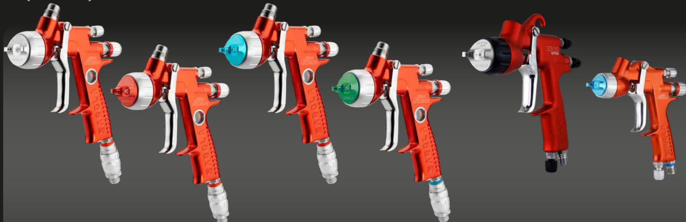
4600 Xtreme TITANIA PRO